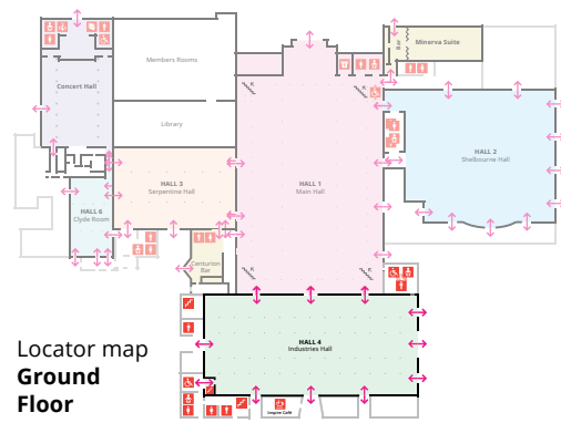
Locator map Ground Floor

T: +353 (0)1 668 0866 | sales@rds.ie | www.rds.ie