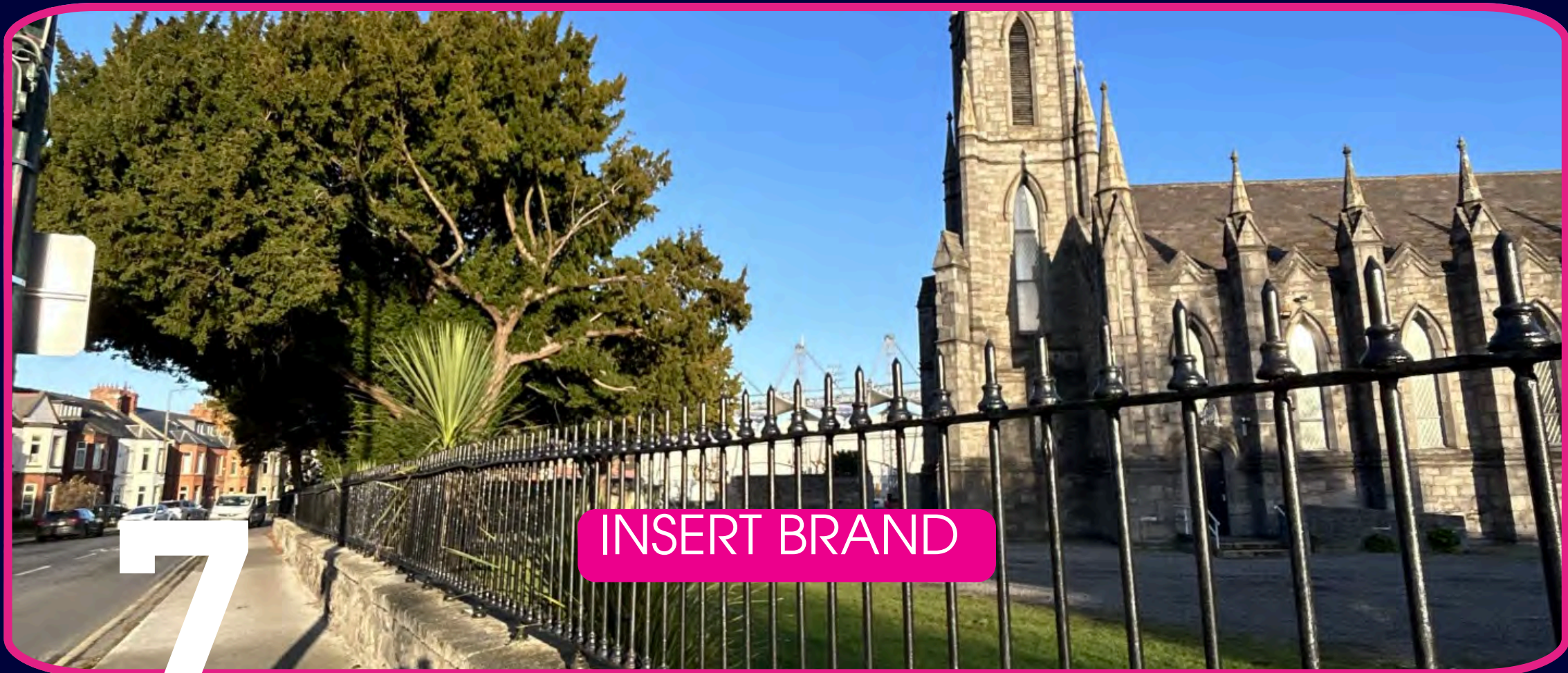
ANGLESEA ROAD RAILINGS