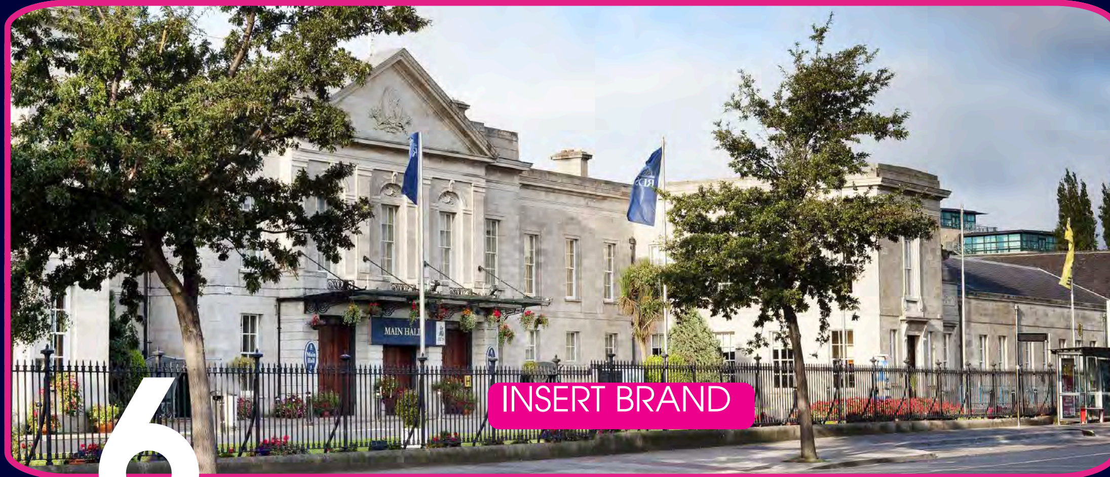
MERRION ROAD RAILINGS